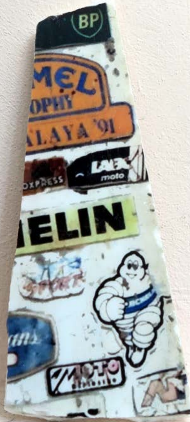
Paramythias IV, digital print on marble, -----cm, 2017