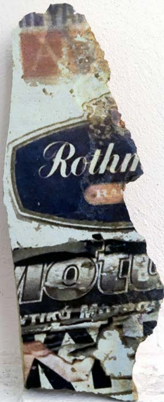
Paramythias V, digital print on marble, -----cm, 2017