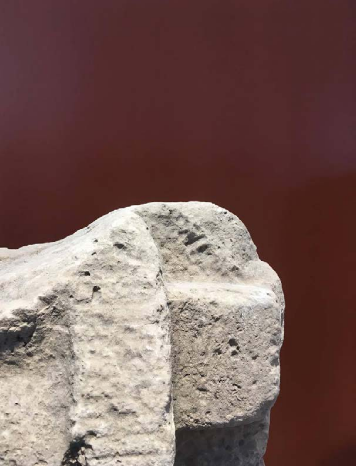
Untitled (red), digital print on paper and wooden frame, 48*36cm, 2017