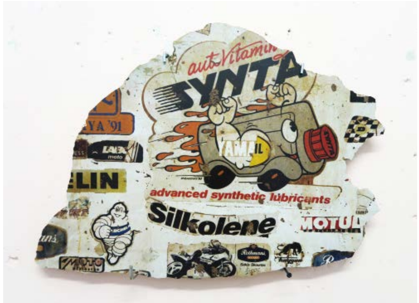
Paramythias I, digital print on marble, 60*43cm, 2017

Paramythias is a pedestrian street located in the center of Athens and most of its buildings are abandonned or have already collapsed. Between those there is one little shop selling old car parts; functioning from the late 70s it still opening part time so as to sell certain things or repair a motorbike. The photo printed on this marble is taken from the vitrine of the car repair shop and its been edited so as to bring on mind archaeological leftovers, ancient pottery iconography etc.