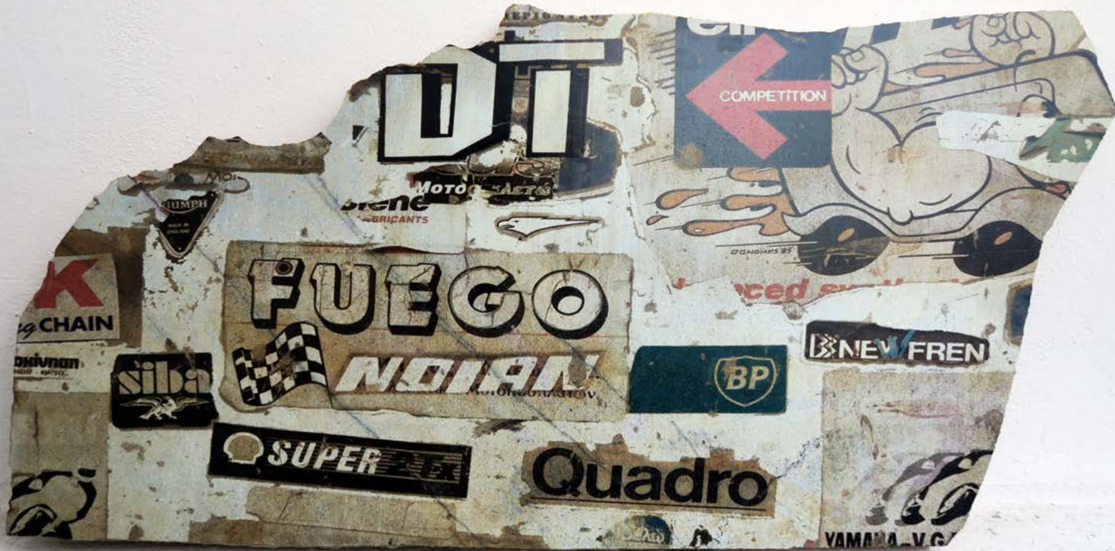
Paramythias VI, digital print on marble, -----cm, 2017