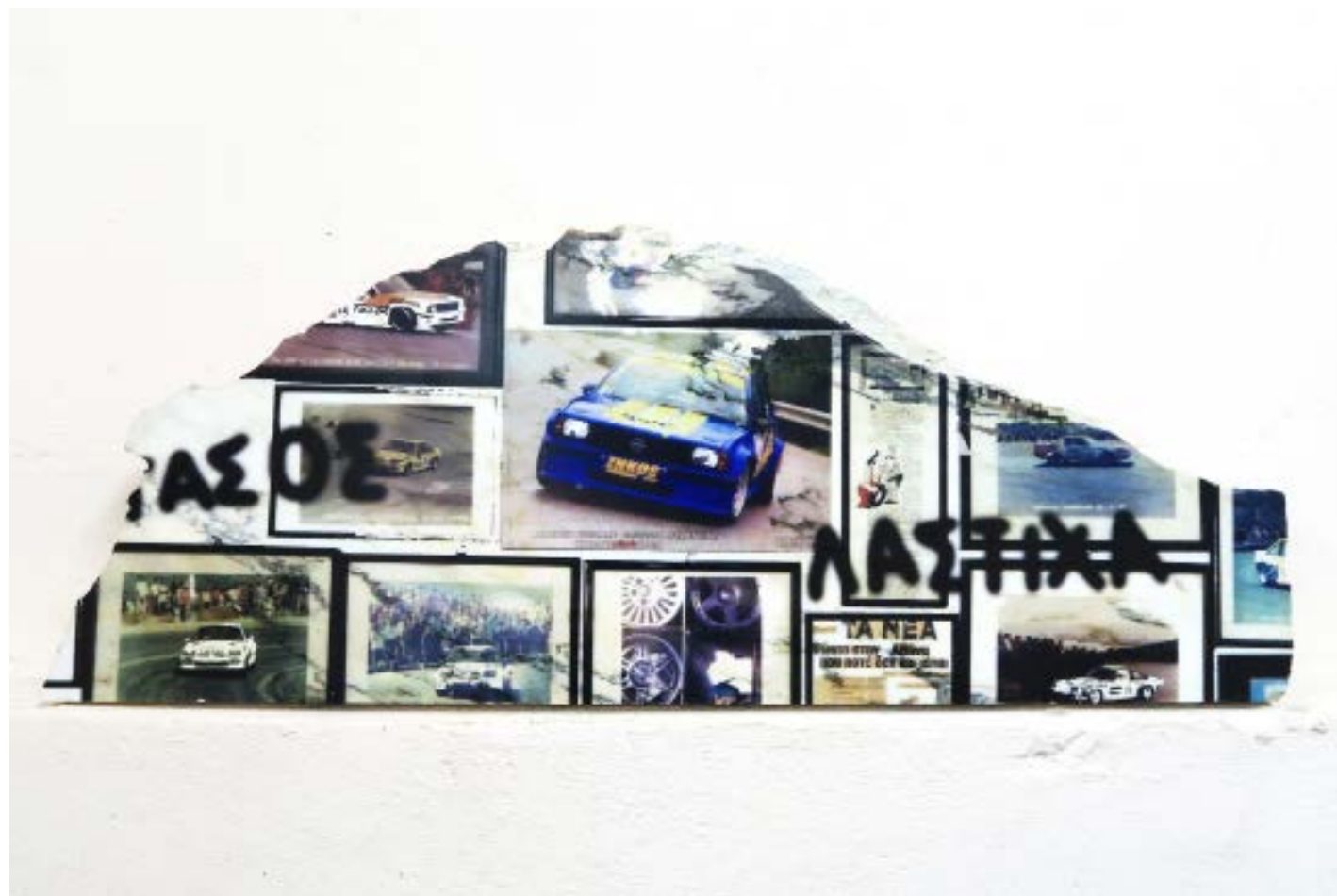
Tasos I, digital print on marble, 100*53cm, 2017