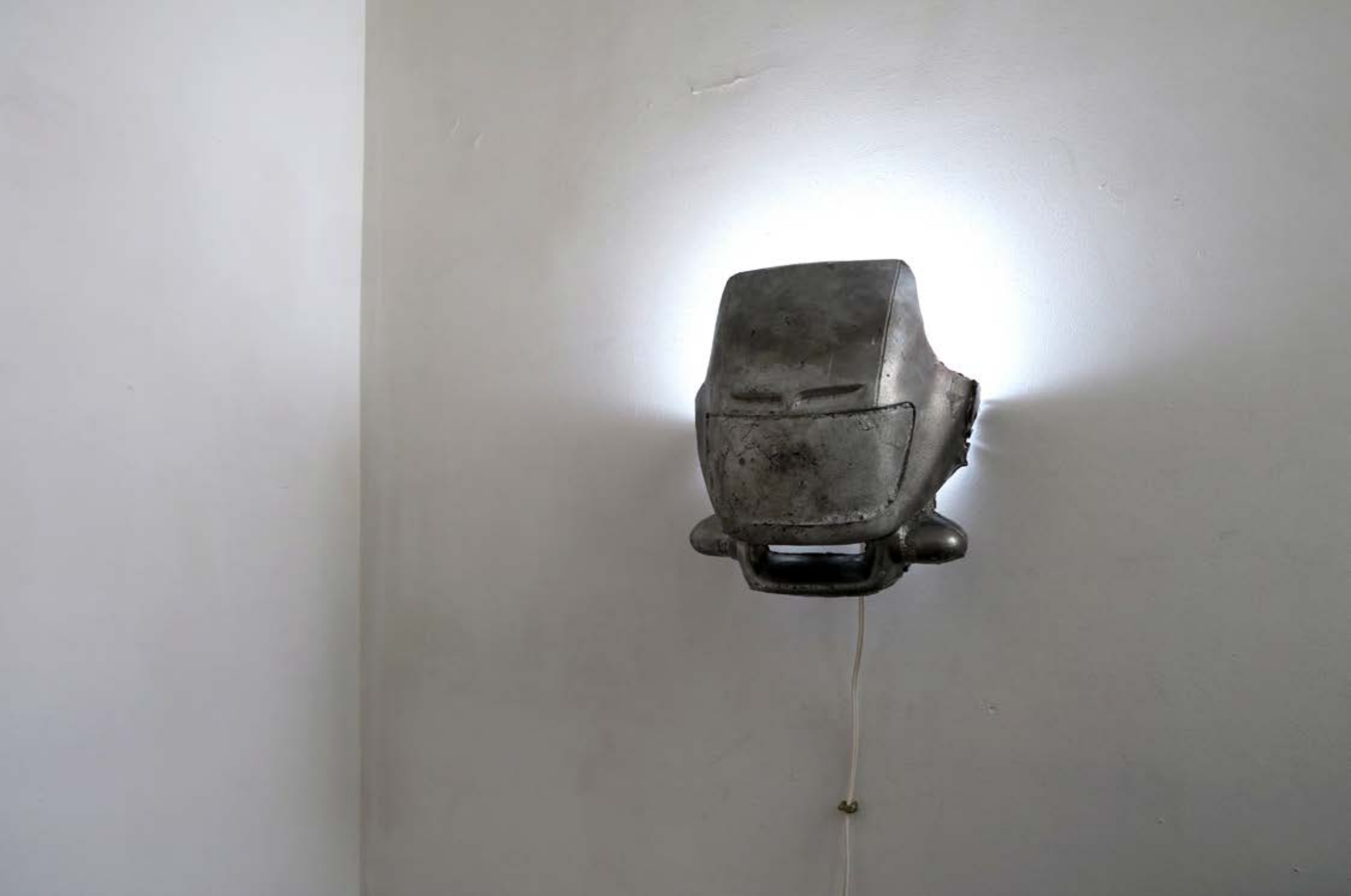
Untitled, cast aluminium and led lamp, 27*30*13cm, 2017, installation view at Clovis XV