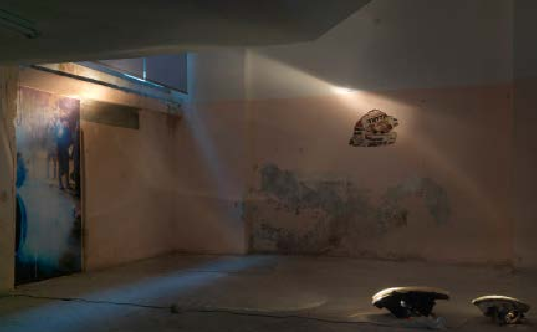
Untitled, digital print on paper pasted on wall, 170*90, 2017 and Paramythias I, digital print on marble, 60*43cm, 2017